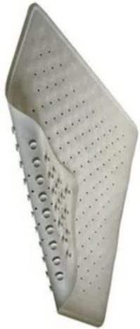
Peak Bath Mat