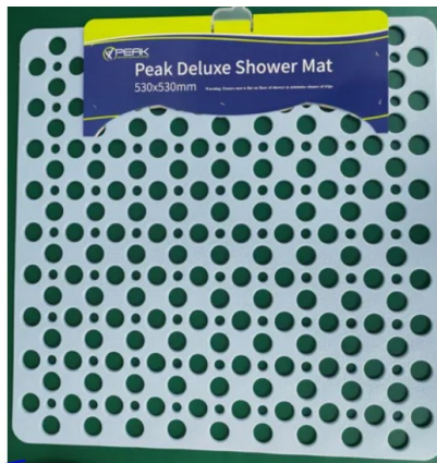
Peak Shower Mat